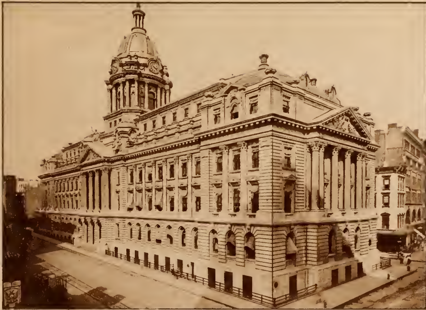
POLICE HEADQUARTERS. Home of New York's "Finest," seat of Police Commissioner.